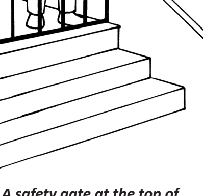
A safety gate at the top of the stairs can prevent a fall.

The Alzheimer's Foundation of America created The Apartment—a model studio residence built to showcase ways that practical design and technology can greatly increase the quality of life for someone living with dementia and help family care partners protect their loved ones' safety. Visit the Alzheimer's Foundation of America - The Apartment: A Guide to Creating a Dementia-Friendly Home (alzfdn.org)